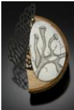
How would Dr. Seuss Explain It? Cracked & Stained Glass Series