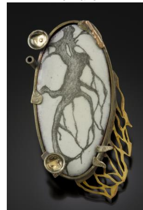
Just Outside Lurks What's Left