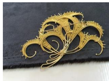
Mary's latest Brooch of workshop