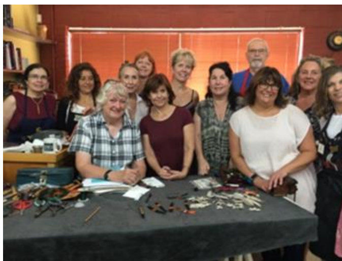
WGG Workshop Group Picture