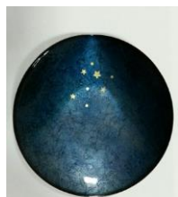
Where Stars Are Born