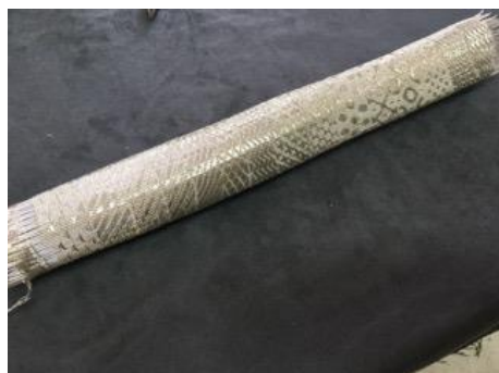
Pattern "roll" in sterling and fine silver