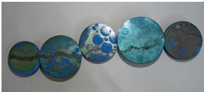
Sometimes We Seem to Keep Going in Circles