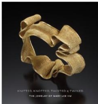
"Knitted, Knotted, Twisted & Twined"