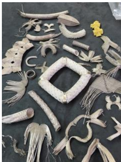
Samples of Mary's work