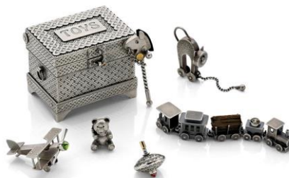
“A Little Nonsense”