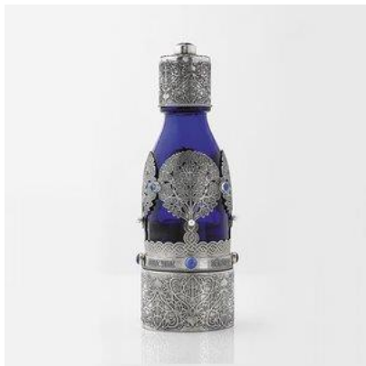
“Well of Life”